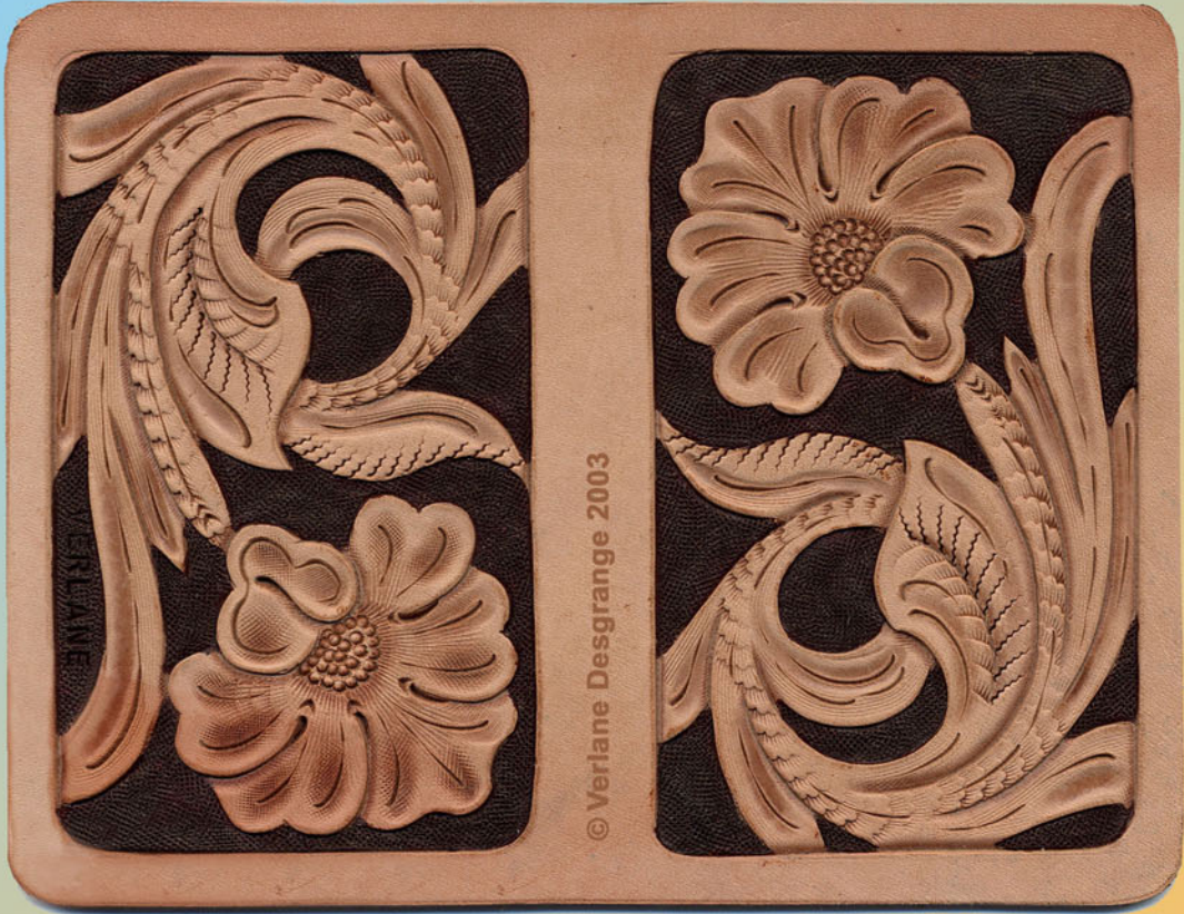
9. Dye background