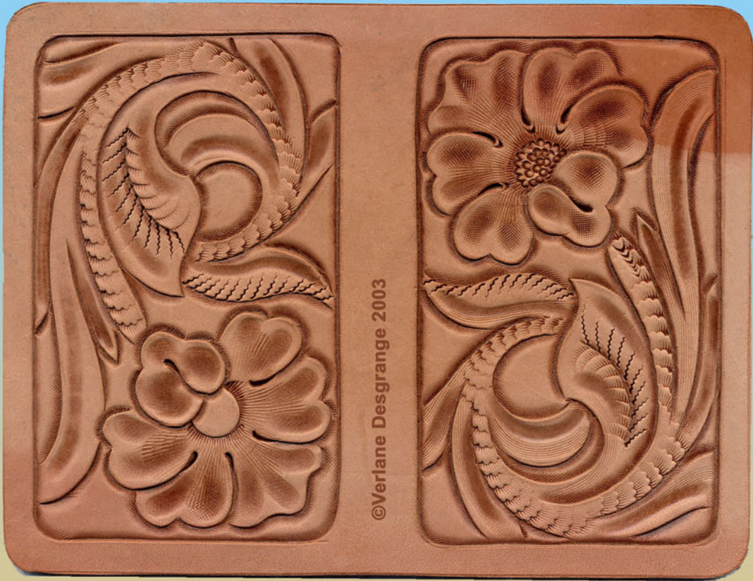
5. Vein, stops