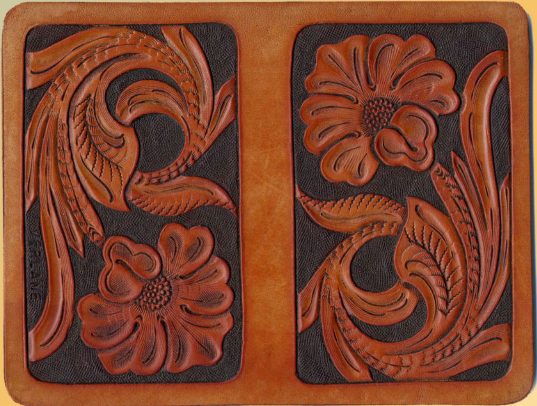
10. Antique and apply clear finish