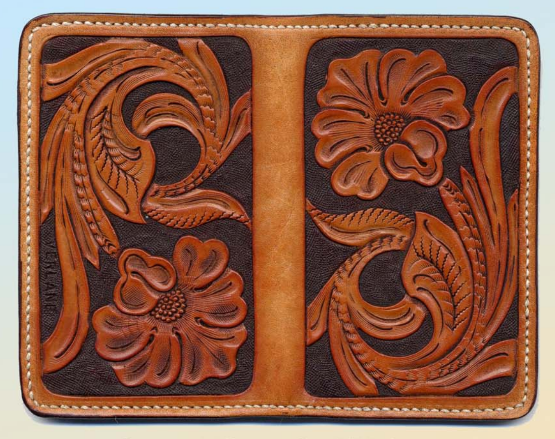
Hand stitched 11/inch with 3/25 linen thread