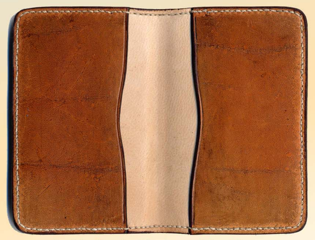
Inside lined with sheepskin skiver