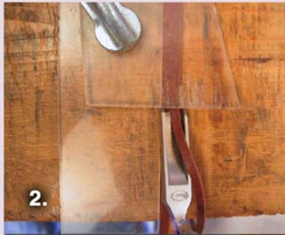
2 & 3. Bevel edge with #6 French edger on homemade edging jig. Do one side and then the other. Hold French edger on angle as shown in #3 to get proper bevel. Edger will be about 40° to side and lifted upward from handle to bench. Edge on lace should be about 1 oz.