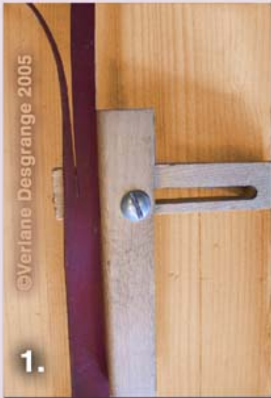
1. Strip 5-6 oz latigo about 5/16" wide for entire length of side.