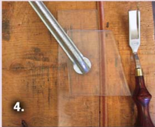
4. Lace now looks triangular. 5. Pull lace through splitter to take off about 2 oz.